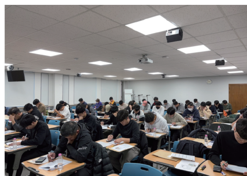
Certification examination (Nov., 2023)