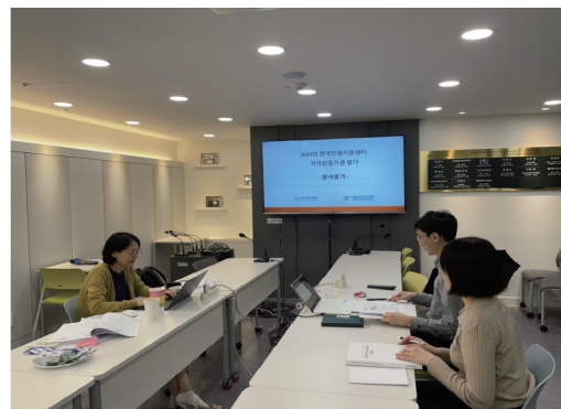
Office Assessment from KAB (Oct., 2023)