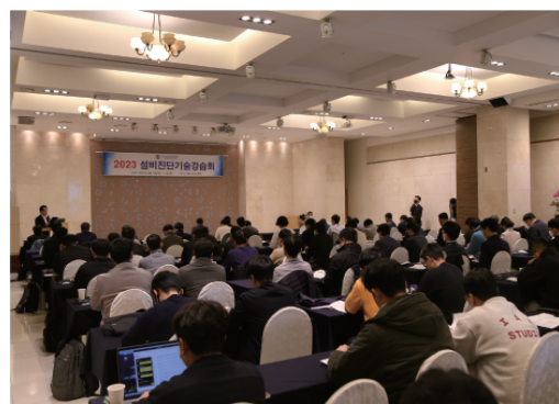
KCIMD Training workshop (Mar., 2023) (1)