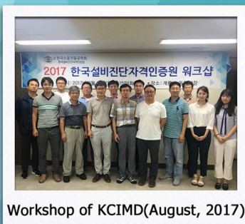
Workshop of KCIMD(August, 2017)