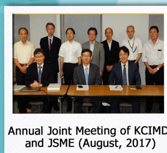
Annual Joint Meeting of KCIMD and JSME (August, 2017)