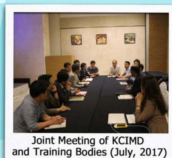
Joint Meeting of KCIMD and Training Bodies (July, 2017)