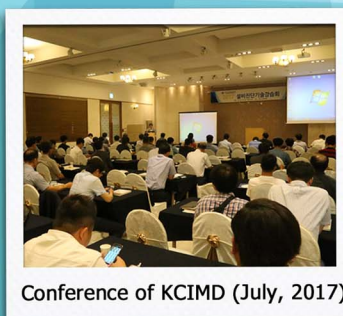
Conference of KCIMD (July, 2017)