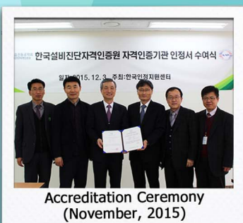
Accreditation Ceremony (November, 2015)